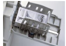
The concave receiving tray creates an air passage during the transport of documents that reduces drying time.