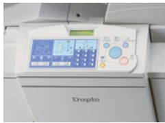
User-friendly control panel simplifies operation.